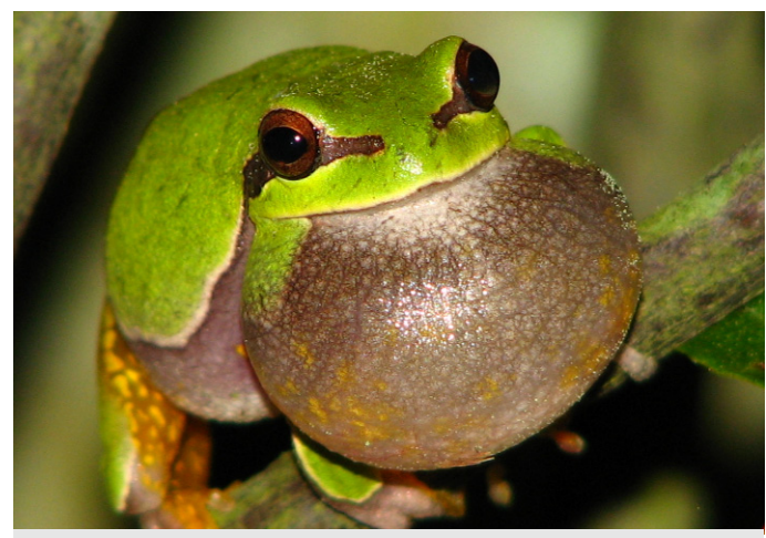
The Pine Barrens treefrog is a native Pinelands species. Commission scientists are surveying frog and toad breeding ponds as part of an EPA funded study.

In 2008, the Commission accepted a grant from the U.S. Environmental Protection Agency (EPA) to quantify the relationship between the proximity of developed lands and the ecological integrity of Pinelands wetlands. The biological indicators that will be examined in the study include palustrine-wetland plants and pond-breeding frogs and toads. The ultimate goals of the project are to increase our understanding of the critical issue concerning the distance between wetlands and upland development needed to protect the ecological integrity of wetlands and to identify relationships that can be more broadly applied throughout the Pinelands as part of the Commission's review of proposed development projects. In 2008, Science staff prepared a Quality Assurance Plan at the request of the grants manager for the EPA. In 2009, staff initiated field work and 52 frog and toad breeding ponds were surveyed monthly from March-June. In 2010, Commission scien-