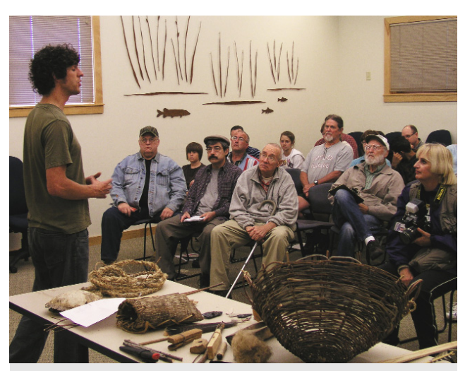
Attendees learned wilderness survival skills during a presentation held as part of the Commission's third annual Pinelands Speaker Series.

For the third year, the Commission sponsored an educational program called the Pinelands Speaker Series, which featured a presentation that provided a hands-on demonstration of how to survive in the Pinelands, including finding food and shelter, locating water and making fire, one that focused on the lesser-known stories of the people in the Pinelands and their struggles and triumphs over adversity in protecting their way of life, and one that uncovered the secrets of Pinelands plants and their nutritional and medicinal uses. The presentations were held at the Richard J. Sullivan Center for Environmental