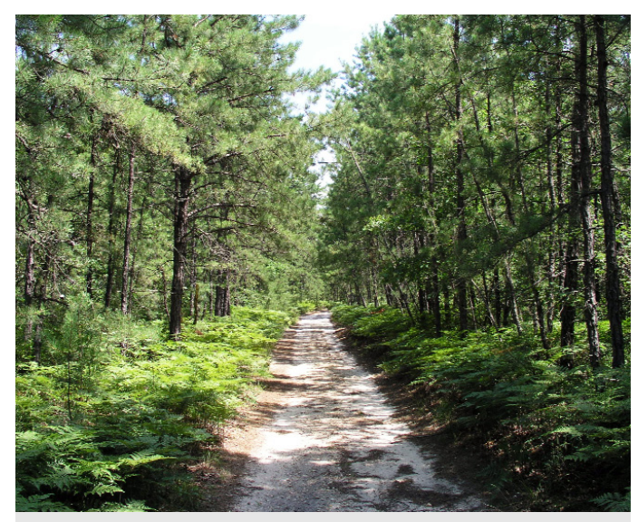
Ferns line the sand road that meanders through the center of a 700-acre property that was permanently preserved in 2009 with funds administered by the Commission.

The Pinelands Conservation Fund was created in 2004 as part of an agreement with the New Jersey Board of Public Utilities to permit the construction and upgrade of an electric transmission line through eastern portions of the Pinelands. Under the agreement, the special fund was established to further the Pinelands protection program and ensure a greater level of protection of the unique resources of the Pinelands Area. The utility that built the transmission lines, Atlantic City Electric (formerly Conectiv), provided $13 million to establish the Fund. An additional $3,415,000 was added to the Fund in 2009 as a result of an amendment to the Comprehensive Management Plan that authorized expansion of the Cape May landfill and through a 2008 Memorandum of Agreement with the New Jersey Turnpike Authority that authorized improvements to the Garden State Parkway.