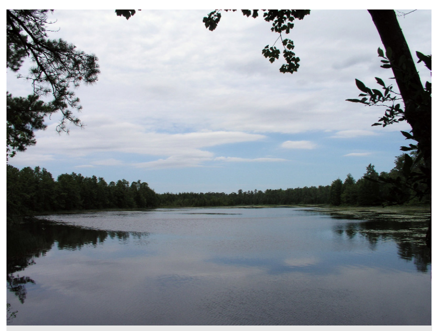
Batsto Lake is among the many natural attractions located along the Pine Barrens Byway.

The Plan sets forth a vision statement and includes specific recommendations and measures that can be undertaken to accomplish a series of Byway goals. For example,