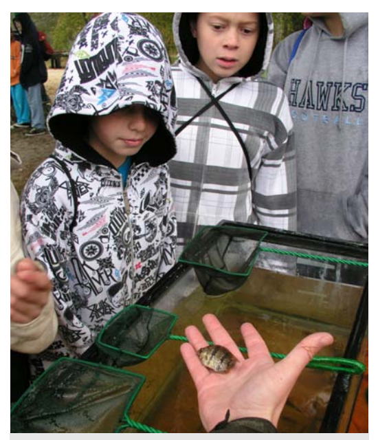
Commission staff educated students about native fish and water quality during the third annual Pinelands themed World Water Monitoring Day event at Batsto Lake.

Additionally, staff organized and carried out its third annual, Pinelands-themed World Water Monitoring Day event. Held at the historic Batsto Village, the event attracted more than 170 students who gauged Pinelands water quality and learned about the importance of protecting the region's unique natural and historic resources. The stu-