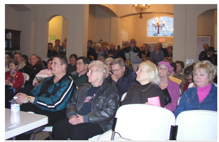
Dozens of residents attended an open house at Horizons at Barnegat on April 2009 to learn about wildfire safety as part of a special joint project being undertaken by the Pinelands Commission and NJ Forest Fire Service.

Barnegat and Stafford townships are located entirely within the Pinelands National Reserve, which is home to fast-draining, sandy soil and expansive pine and oak forests, where more than 600 wildfires occur each year. The two Ocean County municipalities have an extensive history of wildfires, and have high-risk "wildland urban interfaces," defined as areas or zones where structures and development meet undeveloped wildland or vegetative fuels. In addition, the two municipalities are located within close proximity to the Warren Grove Gunnery Range, which was the site of a May 15, 2007 wildfire that burned 15,550 acres and prompted thousands of evacuations.