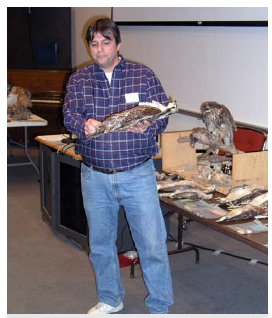
The 20th annual Pinelands Short Course drew a record crowd and offered a popular course about hawks and owls.

The Pinelands Short Course is sponsored by the Commission, the Pinelands Institute for Environmental Studies (or P.I.N.E.S.) and Burlington County College, which has hosted the event at its Pemberton Township campus since 2004. The event is registered with the New Jersey Department of Education, and professional development credits are available to New Jersey teachers who attend.